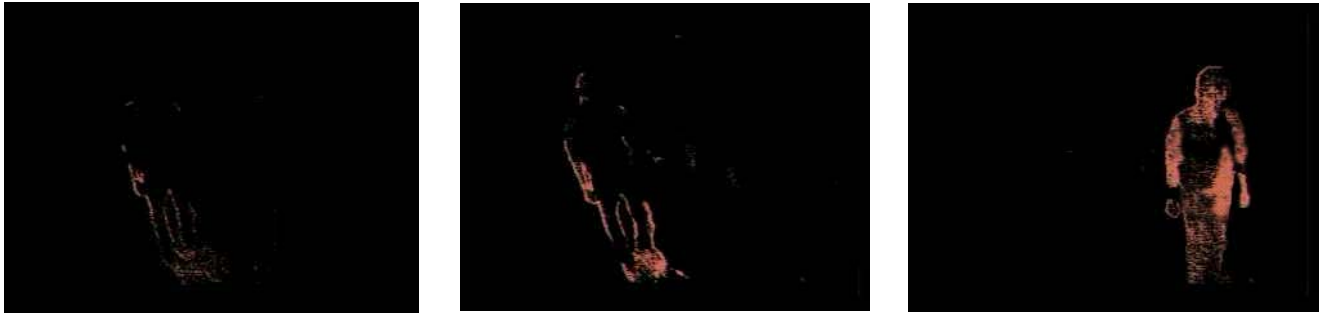
Figure 2: Snapshots of an evolving silhouette. A participant is never completely invisible, however, more details begin to appear as they participate more through the audio channel and through movement.

video wall. Video and audio from each space is captured. The two images are then rendered, blended together, and projected onto the wall of their respective space. The difference between Telemurals and traditional media space connections are the image and audio transformations that evolve as people communicate through the system and the blending of the participating spaces. Another difference is that many existing media spaces are task-oriented [15][21], whereas Telemurals is designed for casual, sociable interaction.