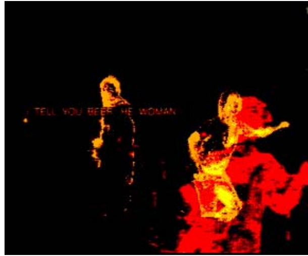
Figure 1: Current Telemurals implementation. The two images correspond to the two connected spaces. In each space, the local participants are rendered in orange, the remote participants in red.

Many similar projects have evolved since the original media spaces and now the term media space refers to any environment created using video, audio, and networked computers to support interaction between distributed groups of people. One example that was designed for social interaction linked three kitchens within an organization. It was an audio-video wall that contained four windows. It displayed windows to the local and connected kitchens and used a cable television feed in the fourth window as a catalyst for interaction. Observations of this system stressed the users want for control of privacy [17].