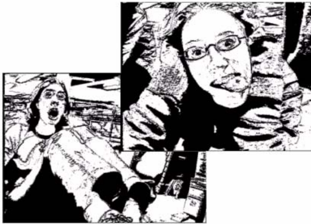
Figure 4: First departure from straight video feed. Each site viewed the other space as a moving comic.

We had many interactions between the spaces, however, they were not sustained for a significant period of time. The next step was to provide a motivation for staying in the space. We had the ice-breaker; now we needed people to use the channel in more interesting ways than simply saying `Hello` and `Where are you?`.