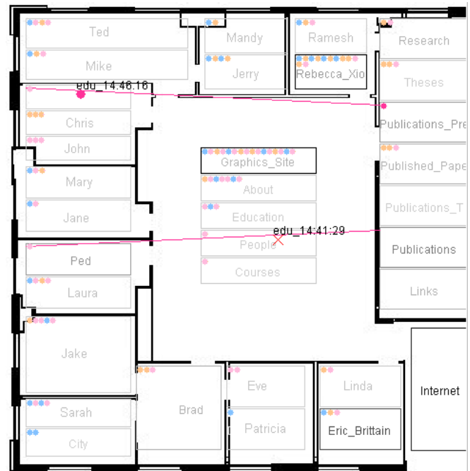
Figure 1 Web Map visualizes the Web site for a research group. Each office contains one or more rectangular areas that represent group or individual member's homepages. Each visitor to a Web page is represented by a dot in the corresponding rectangular area.