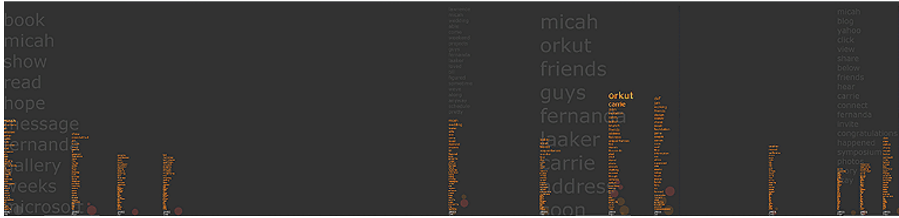
Figure 2: Expanded view of Themail showing the sporadic nature of a relationship. "Blank" spaces between columns of words stand for months when no messages were exchanged between the user and the selected email contact.

different members of their social circles. By visualizing the content of messages, Themail creates a more nuanced portrait of the mediated relationship.