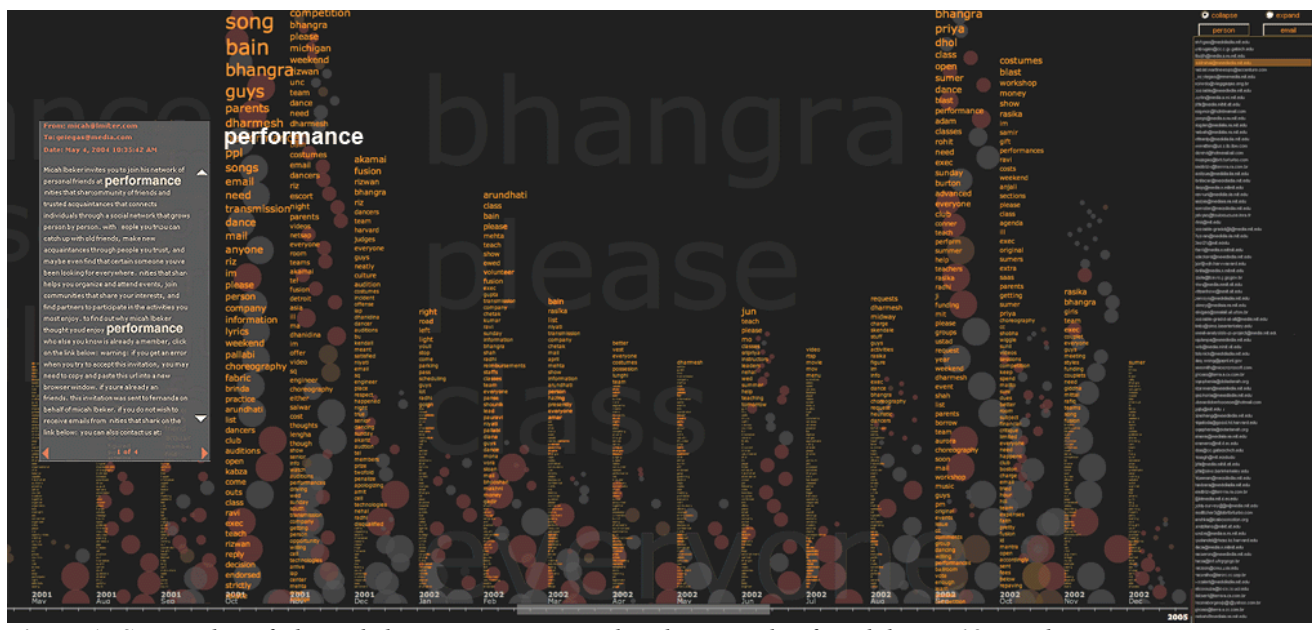
Figure 1: Screen shot of Themail showing a user's email exchange with a friend during 18 months.

MIT Media Lab Cambridge, MA 02139 judith@media.mit.edu