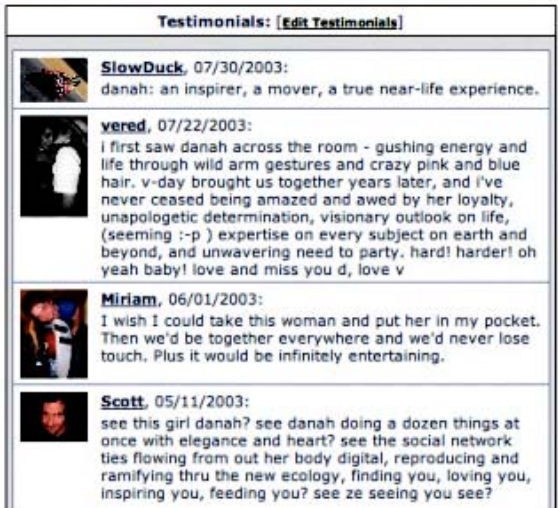
Fig 2 Sample Friendster profile page.

contemporary urban North America, the close personal network often focuses on domestic life, providing companionship and emotional support. Ties have many characteristics: the context in which they formed, the frequency of contact, the closeness of the relationship. Individuals also have a wide social variability across characteristics such as gregariousness, range of interests, available time, resources, etc. To understand an individual's network-based social situation is necessary to look beyond just their immediate structure. Two people who each have a network consisting of a few close ties can have structurally quite different access to information and support. One whose